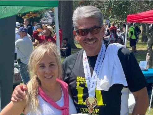
STUDENTS RUN LA